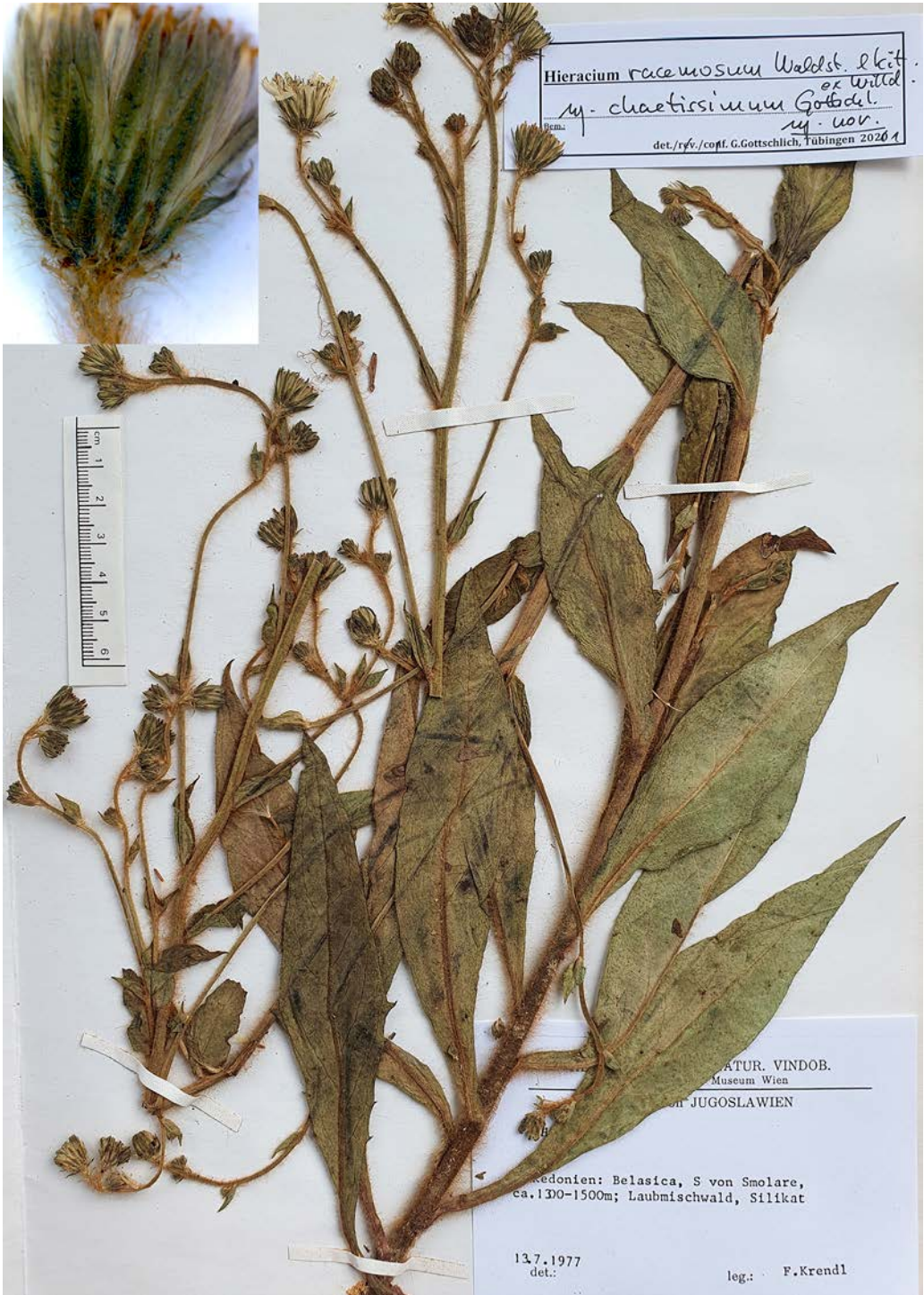
Fig. 4: Hieracium racemosum subsp. chaetissimum GOTTSCHL.