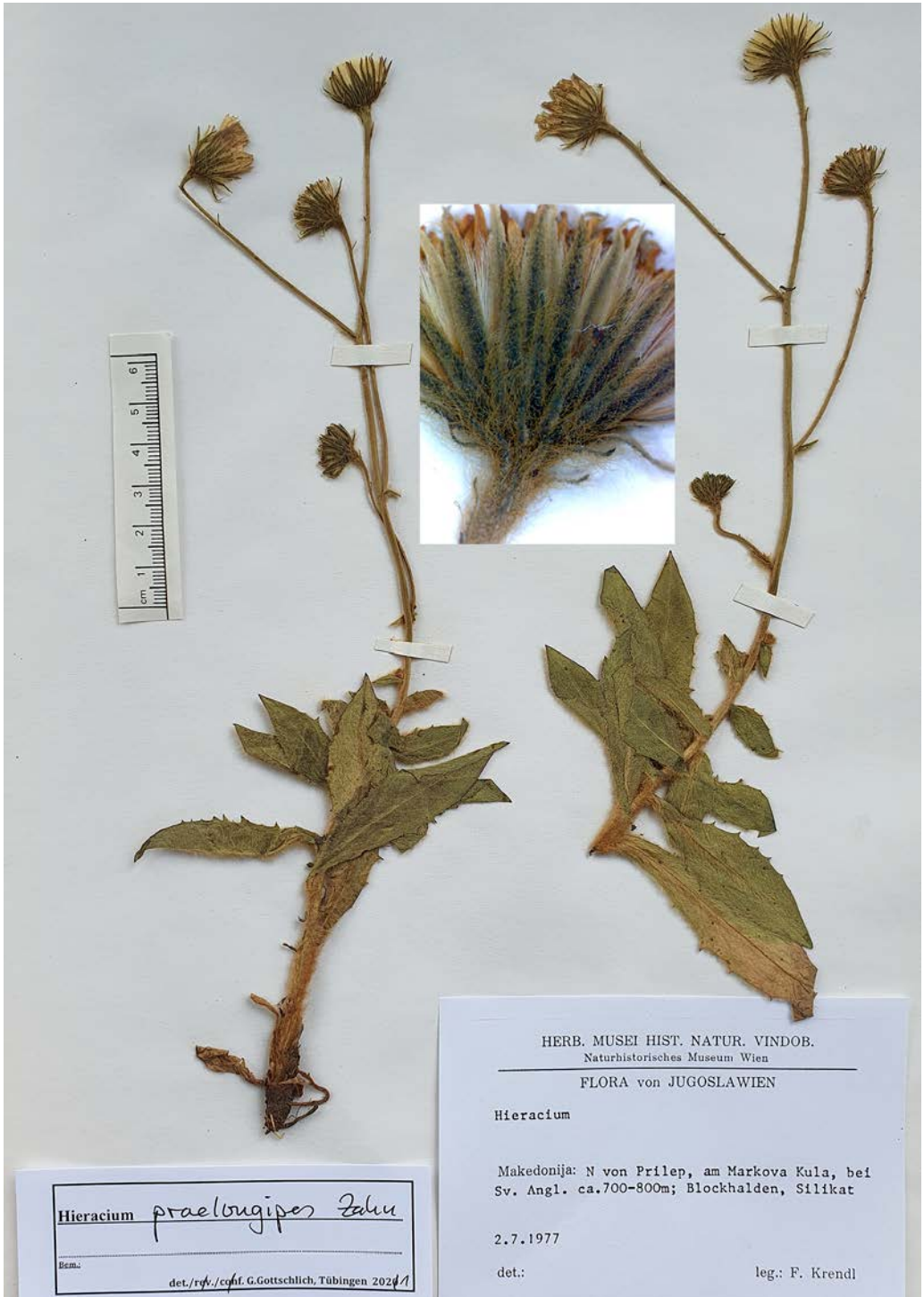
Fig. 5: Hieracium praelongipes ZAHN.