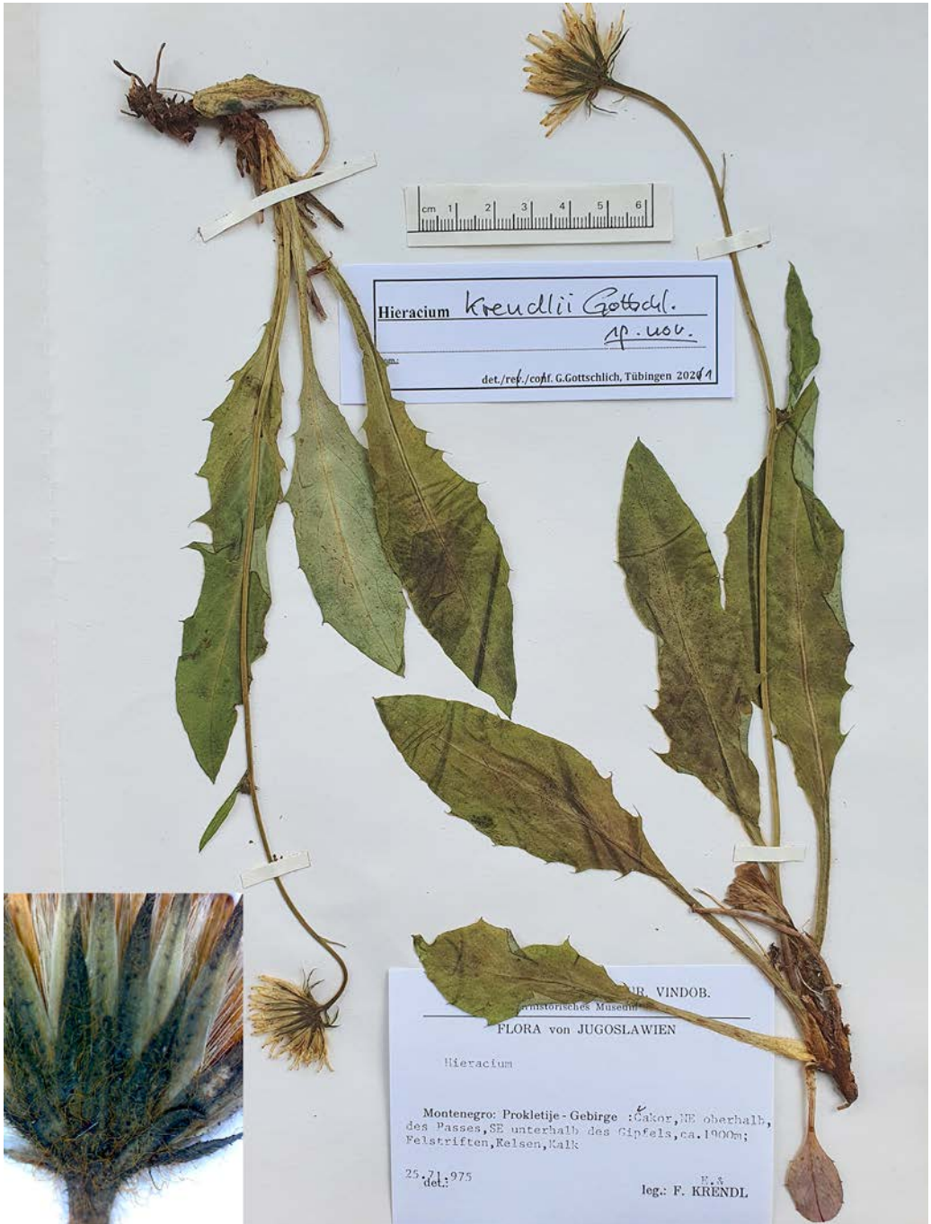
Fig. 2: Hieracium krendlii GOTTSCHL.