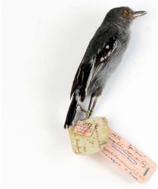
Fig. 6: Thamnophilus cinereiceps PELZELN, 1868 (= Thamnophilus amazonicus cinereiceps PELZELN, 1868), Syntype ♂ NHMW 16.672 with original labels of Johann Natterer and NHMW label (in pink).