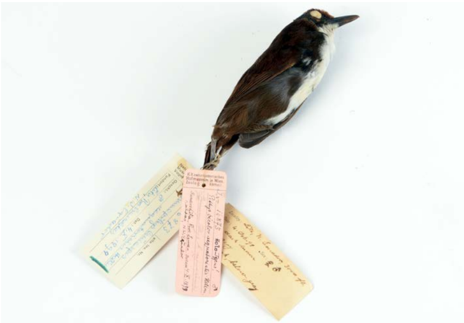
Fig. 5: Syntype of Pithys bicolor aequatorialis HELLMAYR, 1902 (= Gymnophis bicolor aequatorialis (HELLMAYR, 1902)).