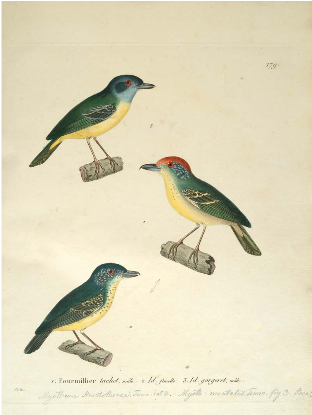
Fig. 2: Plate 179 of TEMMINCK & LAUGIER, 1823; (1) ♀, (2) ♂ of Myiothera strictothorax TEMMINCK 1823; (3) ♂ of Myiothera mentalis TEMMINCK, 1823.