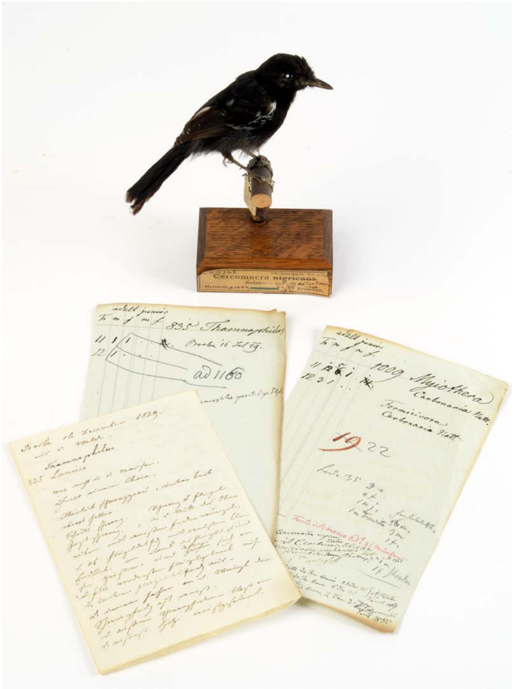
Fig. 3: Field diary and notes of Johann Natterer (with additions of other persons) concerning Thamnophilus aethiops punctuliger PELZELN, 1868 and Cercomacra carbonaria SCLATER & SALVIN, 1873 (on top).