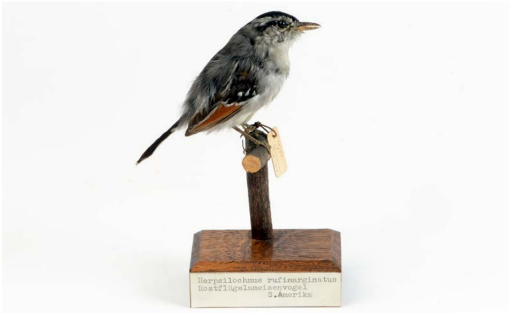
Fig. 7: Herpsilochmus rufimarginatus (TEMMINCK, 1822); ♂ NHMW 15.182, an uncertain type specimen in the NHMW collection.