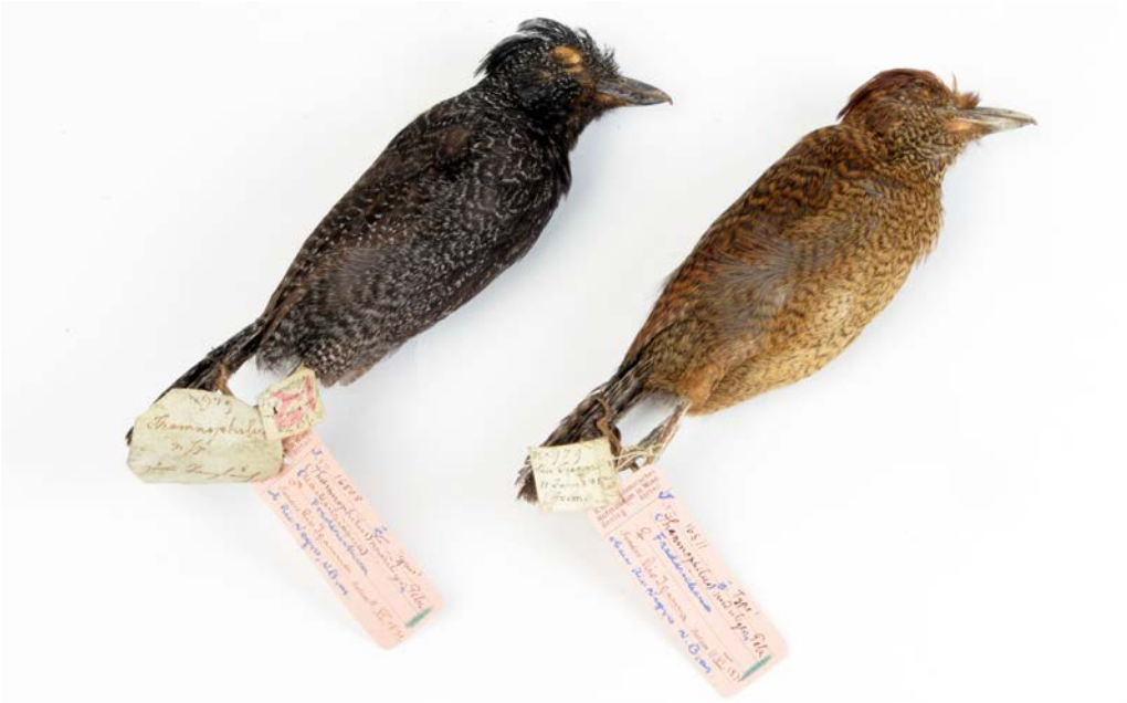
Fig. 4: Thamnophilus unduliger PELZELN, 1868 (= Friederikena unduliger unduliger (PELZELN, 1868)), ♂ NHMW 16.508 and ♀ NHMW 16.511 with original labels of Johann Natterer and NHMW labels (in pink).