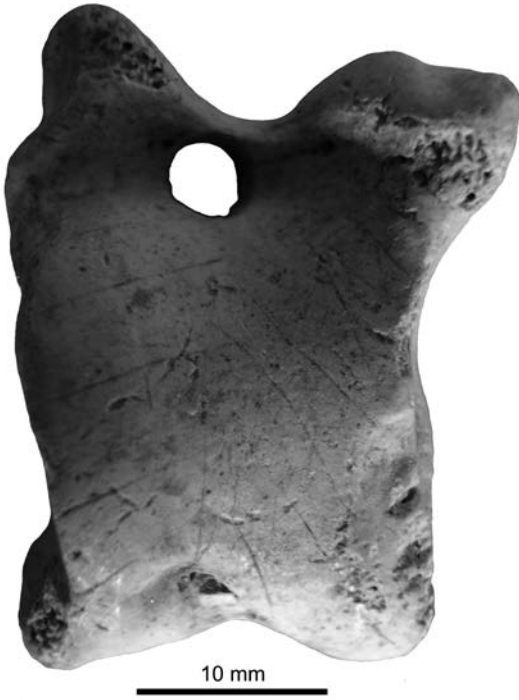
Figure 2. Bronze Age perforated caprine talus engraved with a chevron pattern (su 71; n°356).