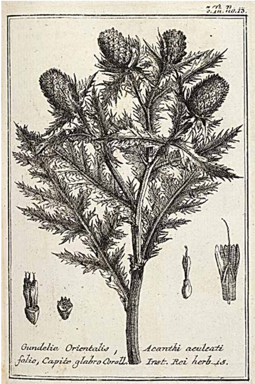
Fig. 1: Gundelia , drawing of TOURNEFORT (1718).