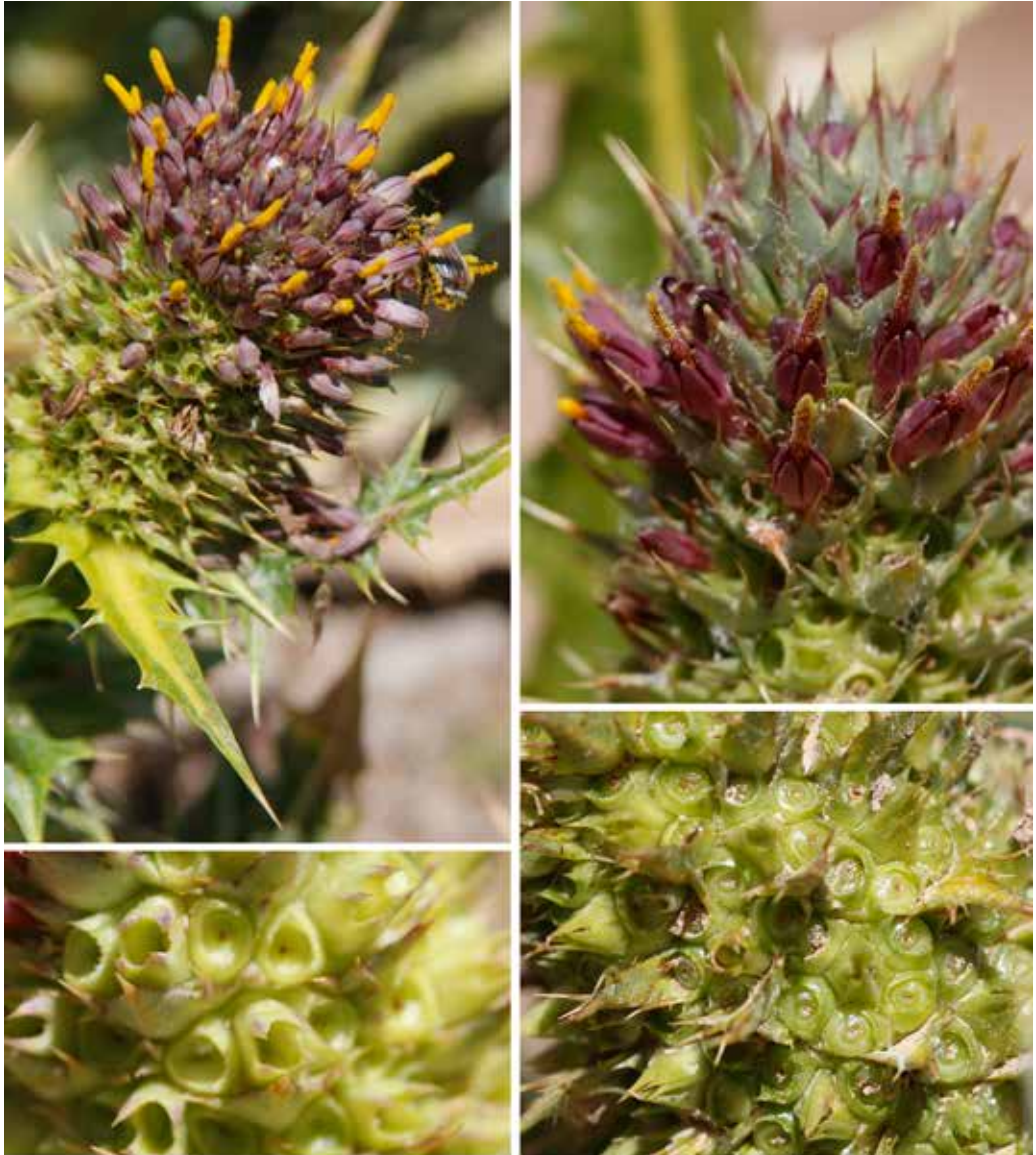
Fig. 2: Gundelia glabra at the type locality near Bayburt (Vitek et al. 13-0173).

The description of Gundelia glabra (MILLER 1768) is not very informative with "acanthi aculeati folio, capite glabro". There is additional information in the english text, which helps to differ this species from other Gundelia taxa: "... generally found in dry strong land. .... Seldom rise more than a foot and a half high; ...". The probable original locality is given as "Baibout in Armenia". This is the only hint to be followed. This place was identified with Bayburt (Turkey, 40°15'19"N 40°13'29"E). No type material could be found.