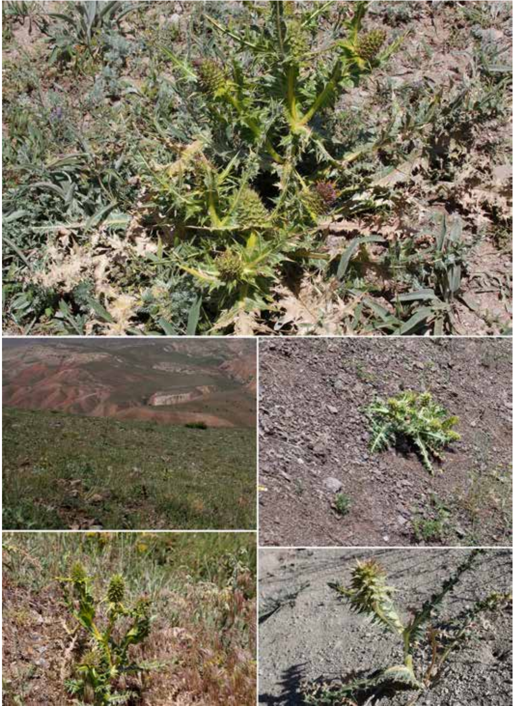
Fig. 4: Gundelia glabra , habitats. a) type locality, dry grazed meadow (Vitek et al. 13-0173); b) dry grazed meadow (Vitek et al. 14-068); c) dry roadside slope (Vitek et al. 14-089); d) mountain meadow (Vitek et al. 13-0216), e) gravel slope (Vitek et al. 13-0198).