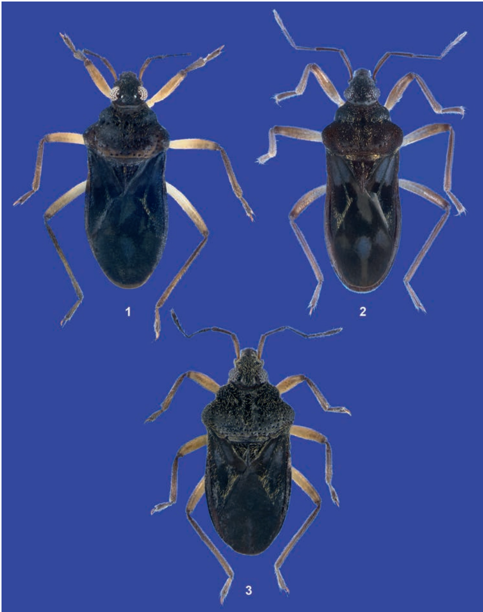
Figs. 1–3: Habitus, dorsal aspect, of (1) Neotimasius bruckneri sp.n. (holotype, female, NHMW-Hemiptera Inv.No. 9304); (2) Neotimasius orientalis (male, NHMW-Hemiptera Inv.No. 5735); (3) Timasius fenestratus sp.n. (holotype, male, NHMW-Hemiptera Inv.No. 9305).

divergent. Preocular tubercles absent. Anteclypeus slightly compressed, in lateral aspect hardly convex. Buccula (Fig. 5) high, with two large circular impressions, posteriorly almost rounded, ventral tooth strongly reduced to a minute denticle. Head between antennal tubercle and buccula with one additional large, circular impression (Fig. 5; also