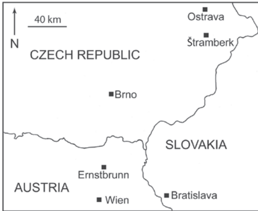
Fig. 1. A schematic view of the study area.

made available are the oldest known members of the Munididae. Both the excellent preservation of these specimens and their unique characteristics present an opportunity to improve our understanding of the early history of the munidid lineage.