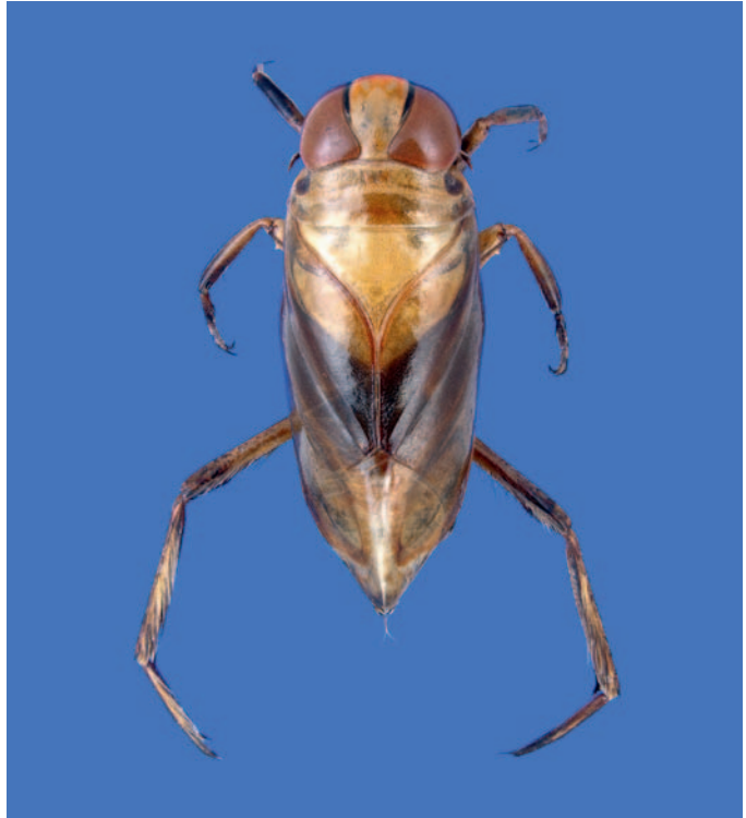
Fig. 1: Habitus, dorsal aspect, of Enithares unguistigris sp.n., male paratype.