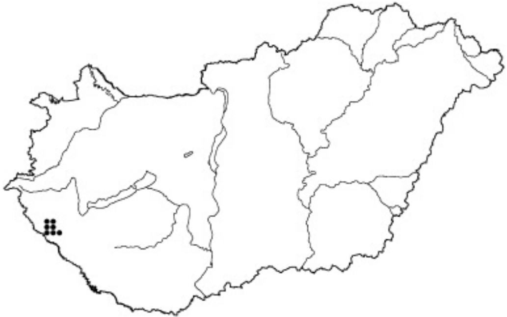
Fig. 2: Distribution of Carex randalpina B.WALLN. in Hungary (original: G. Király).

communities developed on former hayfields. It is, however, present also in alder gallery forest edges, forming a mosaic with tall herb communities. In its relatively homogeneous stands only few other species are present ( Filipendula ulmaria , Lythrum salicaria , Cirsium rivulare , Lycopus europaeus ) and the species pools of the stands are similar to those of the tall sedge communities composed of other creeping sedges (in this region Carex acutiformis , Carex buekii ). The occurrence of Carex randalpina in the region is analogous to the presence of species of more montane distribution in the nearby area (e.g., Anthriscus nitida , Trollius europaeus , Gagea spathacea ). As a historical addition to the discovery, it is worth mentioning that due to the agricultural recession starting at the beginning of the 1990s, the livestock population of the area decreased drastically and most humid meadows in the stream valleys were abandoned. Here, with the end of the traditional meadow use (mowing, grazing) tall herb community species spread and parallel to this, tall sedge species previously undetected or regarded as rare ( C. buekii , C. randalpina ) appeared.