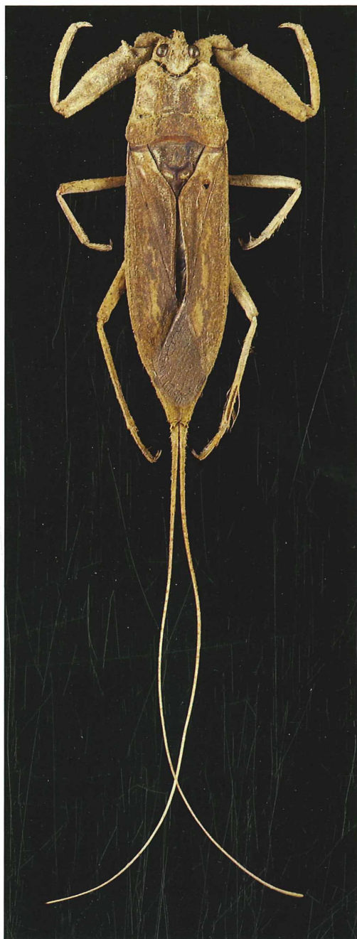
Fig. 21: Laccotrephes longicaudatus sp.n. holotype (body length 16.3 mm), habitus in dorsal view.

median carinae broad and dorsally blunt; transverse groove medially interrupted, laterally of submedian carinae deep and wide, medially shallow and narrow. Lateral margins of pronotum very slightly concave to virtually nearly straight, humeral angles roundly projecting; humeral width of pronotum distinctly less than maximal width (4.4–4.9). Prosternal carina (Figs. 6, 7) varying from virtually flat to indication of a tooth anteriorly. Scutellum, hayfork-shaped carinae well developed except for the middle anterior part. Abdomen parallel-sided in anterior two-thirds, posteriorly convergent in males, lateral margin of abdomen slightly convex in females.