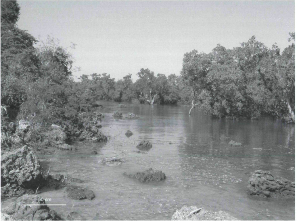
Fig. 1: Collection site at Ekas Bay, Lombok. The specimens can be observed and caught in the zone between mangrove forests and rocky coastline. In front, flotsam covers the water surface between the rocks. During low tide the collection site and the mangrove forest fall dry.

Rensch (in GRIMPE 1931) found his specimens directly in front of the mangrove forest in small pools with muddy sediment and amongst the mangrove roots ( Sonneratia sp.). We caught our specimens in an area between the mangrove forest ( Avicenna sp.) and the rocky coastline (Fig. 1). This small zone (width about 20 m, length about 50 m) is sandy and lacks vegetation. North and south of this area the beach is sandy. No individuals were detected between the mangrove roots or on the sandy bottom. The collection site and mangrove forest are submerged at high tide (to about 1.2 m high) and fall dry at low tide. During high tide, garbage, leaves and other plant material are transported here by the current. On some days this flotsam covers almost the whole water surface; this differs from all known habitat conditions of cephalopods and in particular of pygmy squids. Interestingly, I. pygmaeus was detected here, caught in high numbers within or below the flotsam.