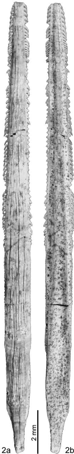
Fig. 2: Myliobatidae or Dasyatidae , tail spine, Grund (GRU-F-11); Badenian, Lower Lagenid Zone. – NHMWien 2002z0127/0008. – a: upper surface, b: lower surface.

The determination of the freshwater material relied on the excellent overview of morphotypes of the pharyngeal teeth ("Schlundzähne der Cyprinen" by HECKEL 1843: Plate 1), because only few publications have dealt with such fossil cyprinid teeth. In this connection the following authors deserve mention: RUTTE 1962, RUTTE & BECKER-PLATEN 1980, OBRHELOVA 1969, 1971 and 1990, RUTTE & VAN DE WEERD 1980, SYTCHEVSKAYA 1989, GAUDANT 1989-1997 as well as BÖHME 1993.